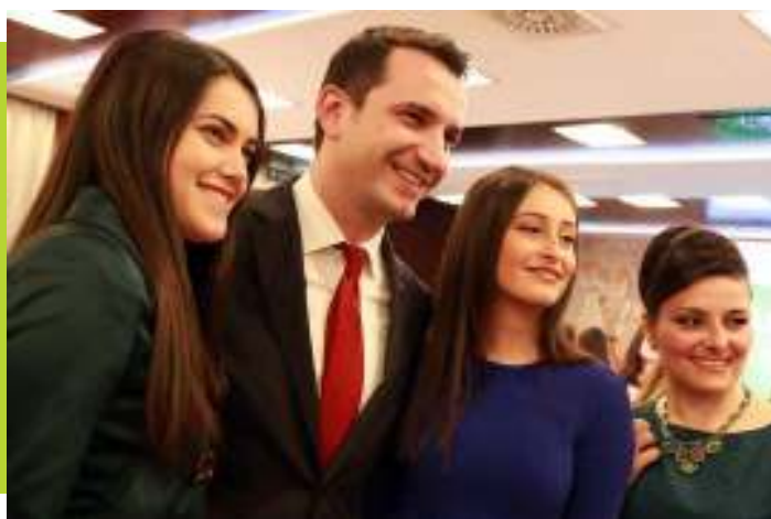
Erion Veliaj Minister of Social Welfare and Youth

“I’m happy to be here with you today. As chic as you all look wouldn’t recognize who made practice and who is the executive but with the hope that those executive. I would like to say thank you all those leaders who took one day of their busy days to dedicate a high school graduate who has all the potential of this world to be like them, maybe and better one day. Really I wish you success in this initiative that you take”